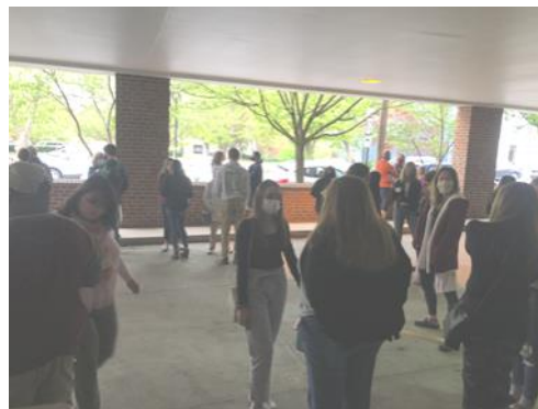
Prayer Partner Reveal